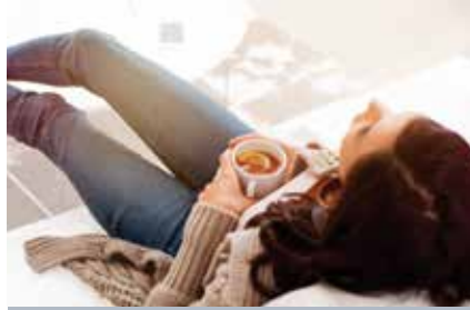
Home Heating Solutions