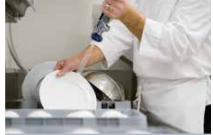
Commercial Water Heating Solutions