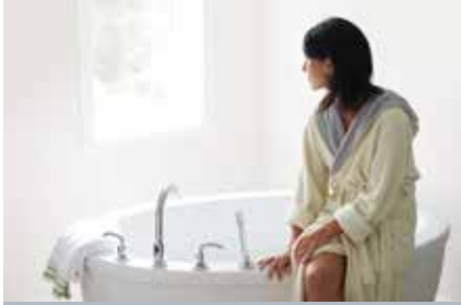
Water Heating Solutions